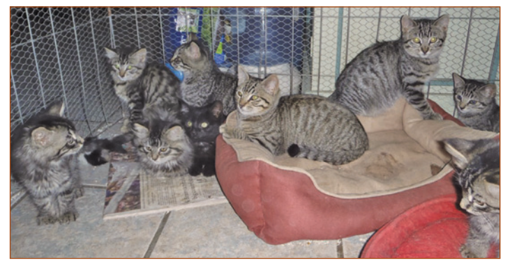
These seemingly healthy kittens were put down due to FeLV.

Barbara. If you have outdoor or indoor/outdoor cats, you should have them tested and vaccinated against this deadly disease.