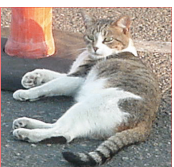
TNR Poster Child: A contented cat from a newly stabilized colony.

While shelters are firmly on board, the biggest challenge continues to be selling the concept of sterilization to pet