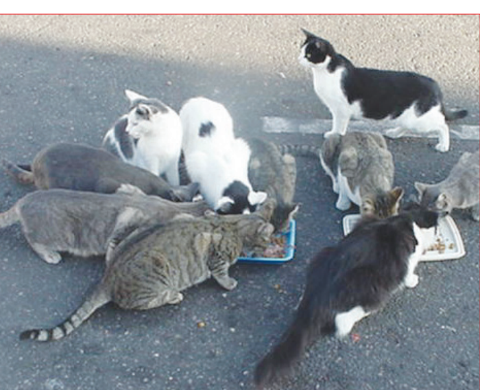
A Few Months Later: Altogether 20 cats were TNR'd at the Goleta site, where population growth is zero and food is plentiful.

Also many thanks to ASAP for assisting us with this colony. The cats are fed and watered daily, and some are now able to be petted. Fortunately, this was done early in the year before