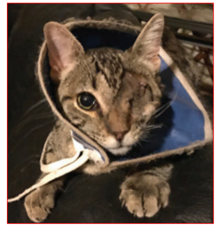
Thanks to Catalyst's Tiny Tim Fund Stitch is headed for better things.

A friendly cat with a severely injured eye had wandered onto a Tepesque farm. Since the farm was in the middle of nowhere and the cat was tame, we can only assume that this poor guy was dumped to fend for himself. Besides the blinded eye, he sported several