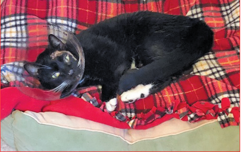
Mighty Mouser: After about eight years of mousing on a North County farm, Bootsy had a run-in with a bobcat that left her at death's door. Emergency surgery at Orcutt Veterinary Hospital gave her a fighting chance at survival.

Bootsy was always in her crate when I went in to check on her, but she was quick to purr in response to my gentle stroking. She was an