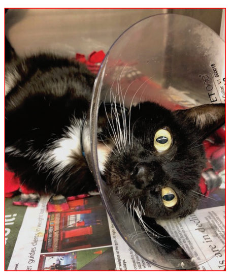
Recovery & Retirement: With recuperation nearly complete the good news came through that ASAP would accept Bootsy for showing to potential adopters in Santa Barbara.

Bootsy is permanently retired as a mouser and deserves to be pampered for the rest of her days as an indoor-only kitty. I'm afraid I may have spoiled her by offering baby food, but I thought she deserved treats after what she'd gone through.