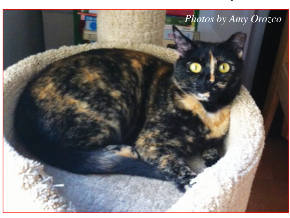
Compare & Contrast: Ava (top), a Catalyst for Cats rescue from Santa Maria, has the classic characteristics of a tortoiseshell cat. Nella (below), with her abundance of white fur, sports the markings of a calico. She also had the mythical personality of a tri-color cat.

Catalyst for Cats doesn't necessarily subscribe to the challenging personality theory of calicos and torties. It does, however, contend that a neutered cat is a contented cat. And that goes for all cats, calicos, torties, and otherwise.