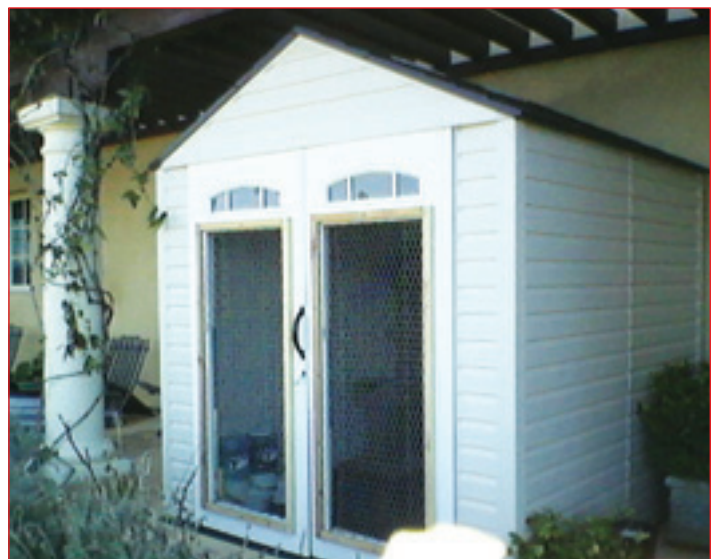
Luxury Condo: The relocation shed for the Main/Blosser kitties at the Clos Pepe Winery near Lompoc is more than basic shelter.