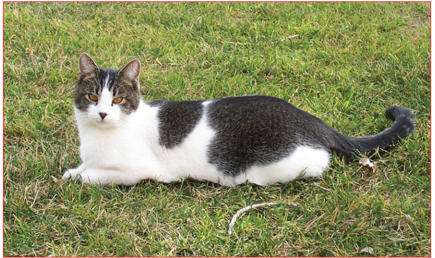
Carefree: Rescued from death row in Santa Maria and his reputation for missing his litter box, this good-looking boy was first relocated to a barn situation in Buellton. And that's where his adventure began!

During the holidays PeePee Pants suddenly came up missing and everyone feared the worst as there were hungry