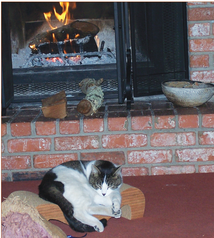
Home Sweet Home: It's been a long journey from a cage at the Santa Maria shelter to a warm hearth in Los Alamos—with several name changes included—but that's all past history now.