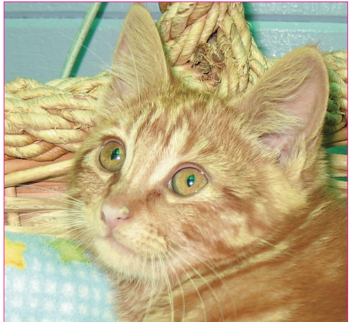
Almost Ready To Go: Razzle will soon be shown for adoption at the San Roque Pet Hospital at 3034 State St. – 682-2647.