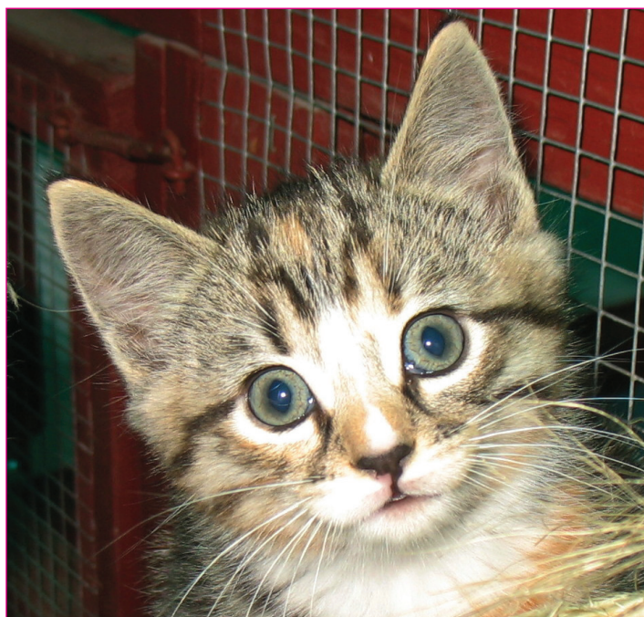
Tigerlily: One of the "Swap Meet kittens." (see photo page 2)

His work continues today on many fronts. It is not the dates that are important – it is the dash between the dates.