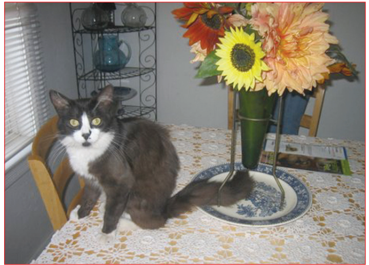
Not So Feral: “Mama Cat” bore several litters—including one in an attic space—before she could be trapped and spayed, but now she enjoys many of the pleasures of a civilized household.

For some reason, my backyard colony cats refused to accept Mama Cat and ran her off. She lives across the street in a vacant lot, but every evening she comes