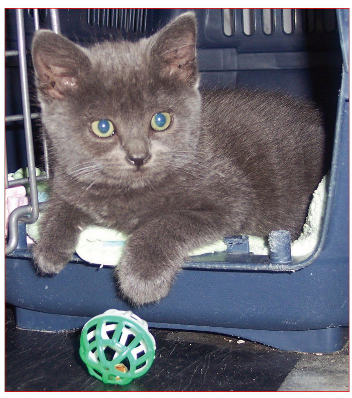
Ready For a Home: Sparkle was trapped with her Mom in Santa Maria, but is now looking for a home to brighten up.

The challenge for our trappers and fosters in the North County continues on a daily basis, seven days a week, day and night. We do the best we can to capture the kittens young