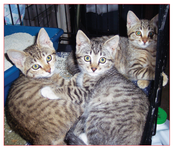
Purring Machines: These three beautiful tabby female kittens were found in a box in a place of business. All of them were given a home together after a brief stay in the adoption cage at the Orcutt Vet.